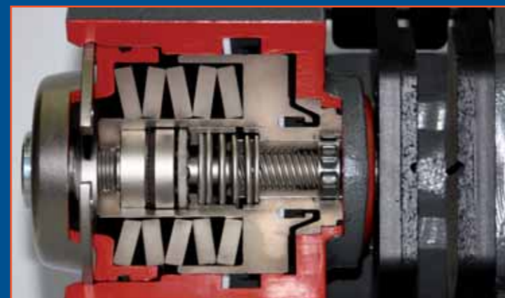
Typical parking brake: Spring applied sliding caliper FSG 110 with automatic adjuster

The long service life and outstanding quality of Knott braking systems are vital to the safety, economy and engineering excellence of the overall system into which they are integrated.